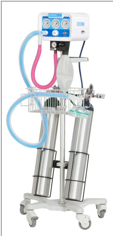
Porter Nitronox Plus