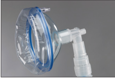
Breathing Circuit Mask

Porter offers a variety of gas delivery methods utilizing single-use, disposable options. For Nitronox Plus, the Porter disposable breathing circuit and mask or mouthpiece can be used. For continuous flow systems, Porter disposable breathing circuits and Silhouette nasal hoods are both available options. All are designed for maximum patient comfort, reliability, scavenging efficiency and infection control.