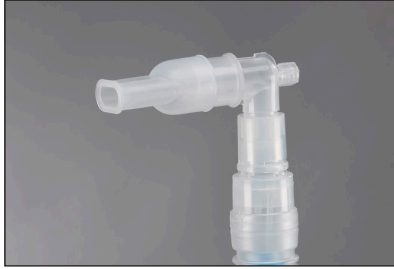
Breathing Circuit Mouthpiece