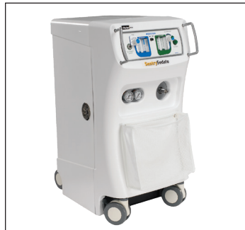
Sentry Sedate Available in analog or digital